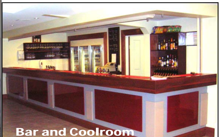
Bar and Coolroom