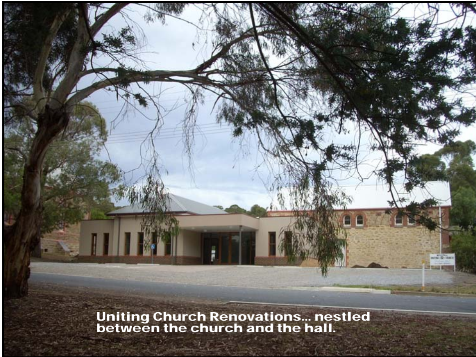
Uniting Church Renovations... nestled between the church and the hall.