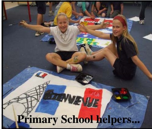
Primary School helpers...