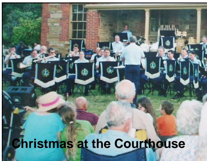
Christmas at the Courthouse

These concerts have been held in previous years and are extremely popular and well attended. Entrance is $2. Bring your chairs & rug.